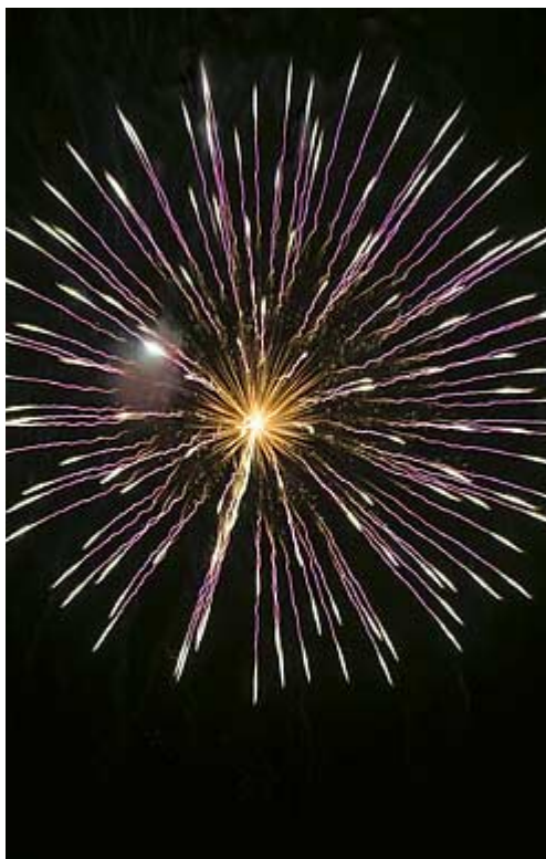
I took this image during the 4th of July Fireworks Workshop.