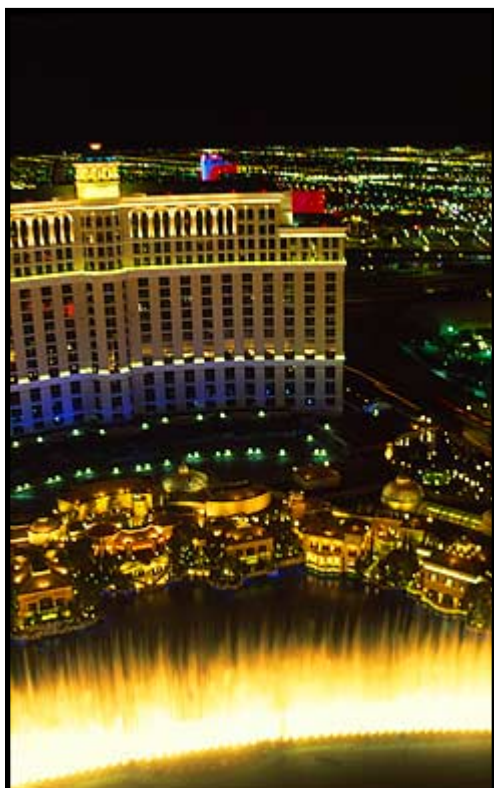
This image was taken from the Eiffel Tower Replica by bracing the camera against the railings.

a subject in the foreground. Now the aperture becomes as important as the shutter speed since the flash exposure can only be controlled by aperture. In this case, I set the aperture according to my flash to subject distance and then adjust my shutter speed for the background. In this kind of photography, it's important that the subject remain static during the length of the exposure. Any movement and a ghosted image or halo will appear around the subject.