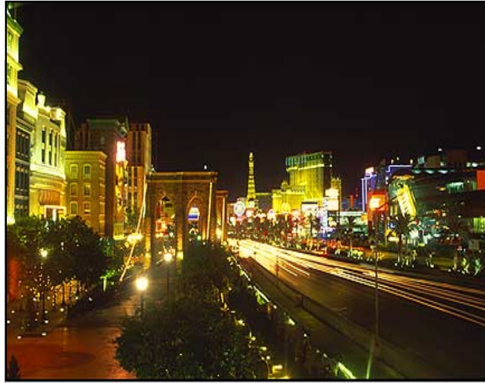
When a tripod is not available, any support will work as long as you keep your camera steady, meaning even holding your breath sometimes. This image was taken using 30sec.@f16.

As I always say, a tripod is an essential tool for the photographer, and with night photography it becomes quite clear. Night photography requires really slow shutter speeds meaning hand holding the camera isn't a good choice unless an artistic blur of lights is intended. Exposure can be tricky when it comes to night photography and a few factors need to be considered before pressing the shutter. I usually meter the lights from the buildings or any other source within the frame and use that as my startup exposure. Then proceed to check any other elements that can be incorporated in my shot. For exam-